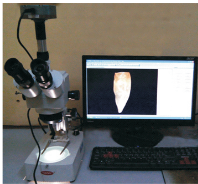
Figure 2. Stereomicroscope in use